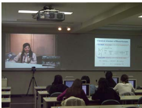
Lecture from Yuan Ze Univ. (Taiwan) using live lecture system

Spring Semester: Progress of ESD in Asia