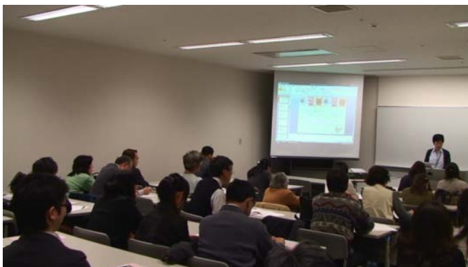
Presentation of Master thesis to Nishinomiya citizens