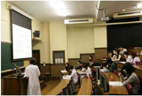
Weekly seminar of graduate students

Graduate School of Human Sciences consists of four research groups; clinical psychology, human behavior sciences, environmental sciences, and health sciences. It is a small but interdisciplinary institution. We focus on education programs to train future women leaders in the society. Our two education program have acquired financial support (2007-2009) from Ministry of Education, Culture, Sports, Science and Technology of Japan as “Initiative for Attractive Education in Graduate Schools”.