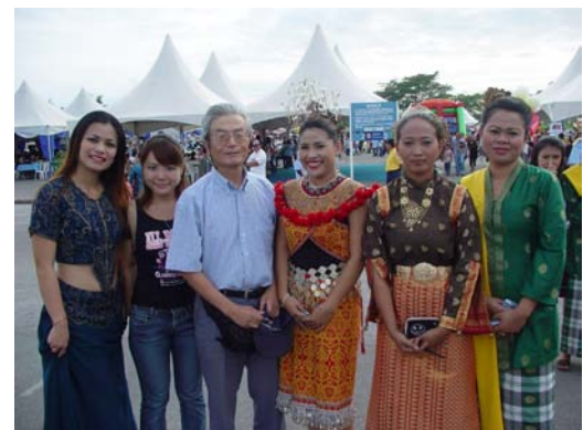
Internship in Indonesia