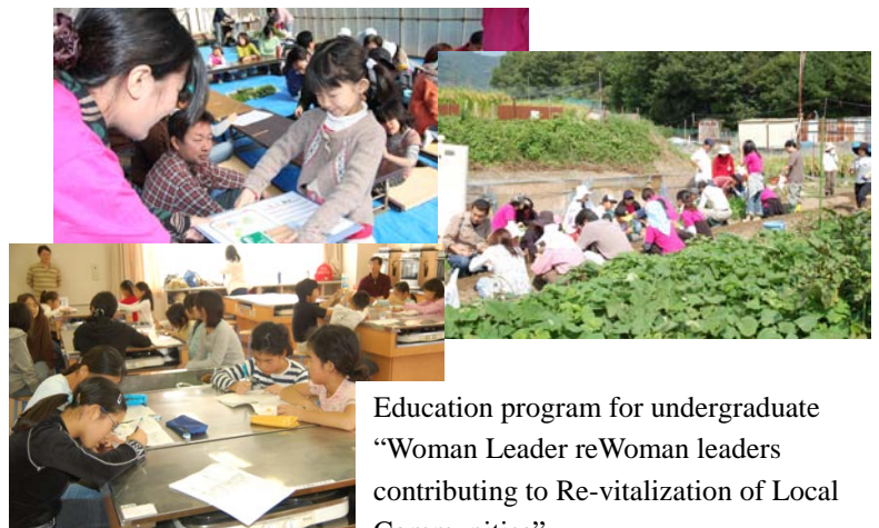
Education program for undergraduate “Woman Leader reWoman leaders contributing to Re-vitalization of Local Communities”