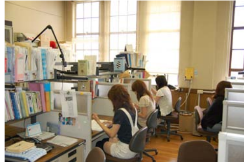
Study room for graduate students